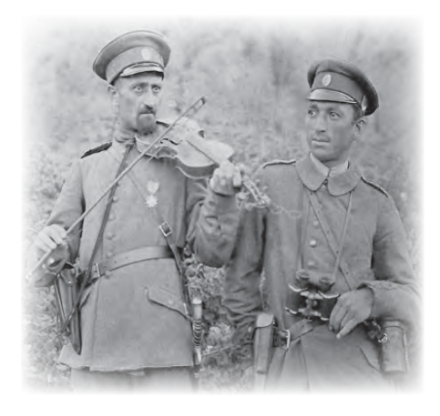
Music from the Front: WW I

Bulgarian Jews saved from the Holocaust. From The Optimists , an award-winning documentary film about the survival of the Bulgarian Jewry